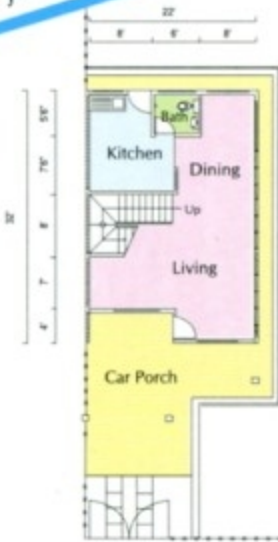
Ground Floor/ Tingkat Bawah