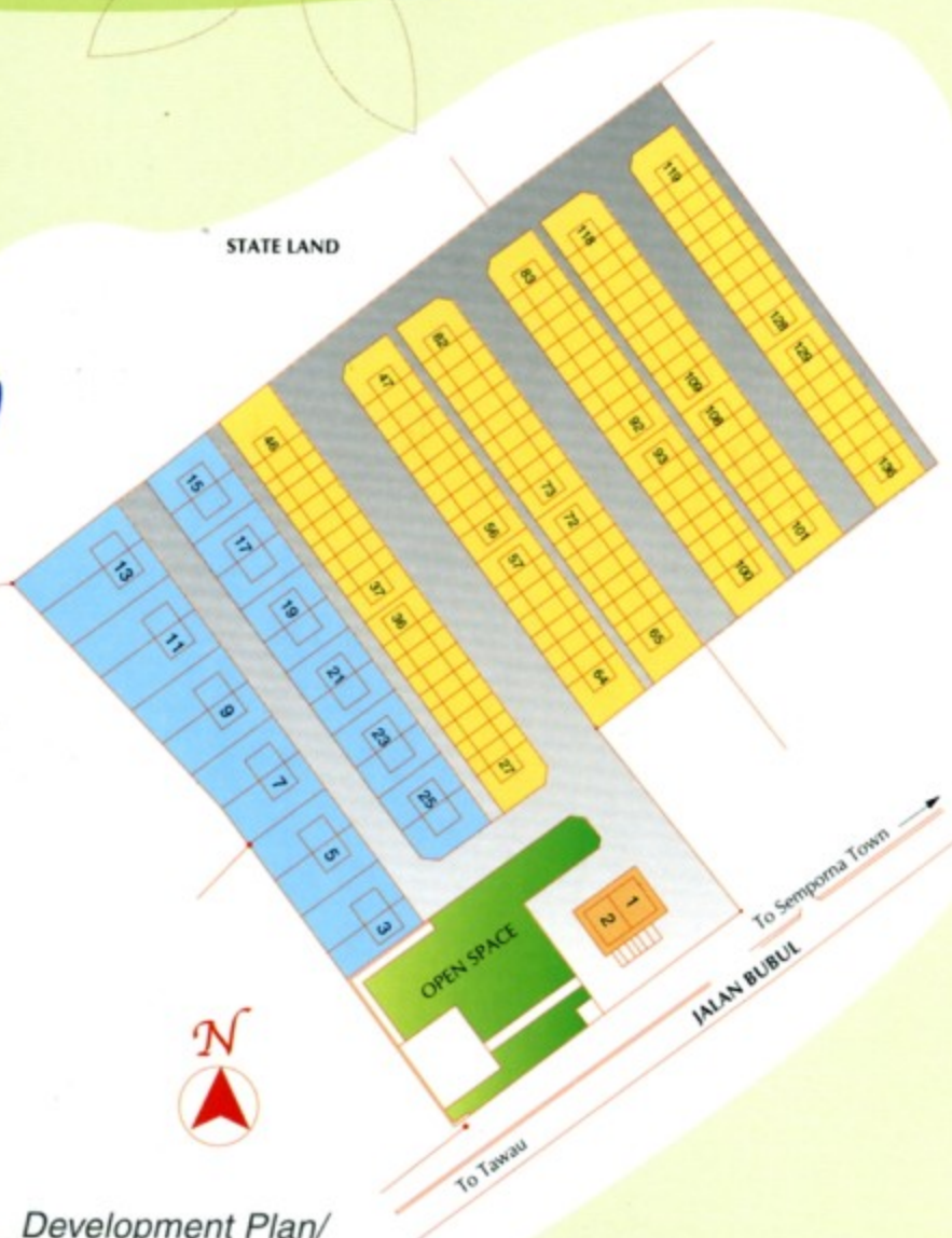
Development Plan/ Pelan Pembangunan

Pengecualian ke atas Duti Setem Perjanjian Jual Beli, dokumen Pindah Hak Milik & Pinjaman untuk rumah berharga di bawah RM180,000.00 Bermula dari 01/06/2003 - 31/05/2004