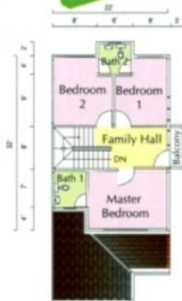
First Floor/ Tingkat Atas