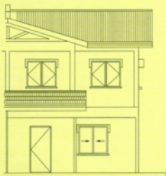
Jaya - Double Storey Terrace/ Rumah Teres Dua Tingkat